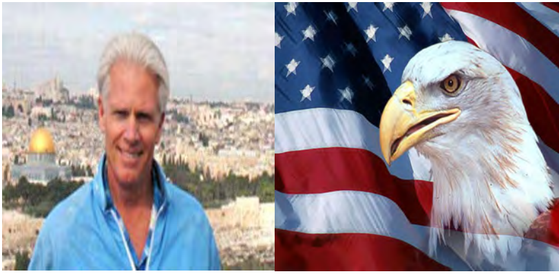
Mt. of Olives, Jerusalem 2009, LeSeaTours www.Rsmworldwide.org Made in the U.S.A.